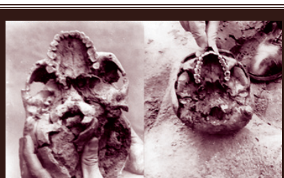
"In an examination of 1276 skulls in succession, I have not yet find one with the typical deformities of our moderns."

Before the advent of modern, processed, refined foods, people died of old age with almost all their teeth still in their mouth. There are many anthropological studies as proof of this.